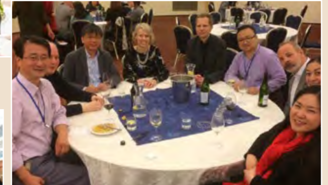
AKSE conference in Prague in 2017