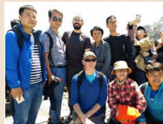
Paektusan mountain on the China-North Korea border