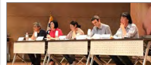
Owen presenting at the Jeju Peace Tour Symposium

In June he participated in the third Peace Study Tour to Jeju