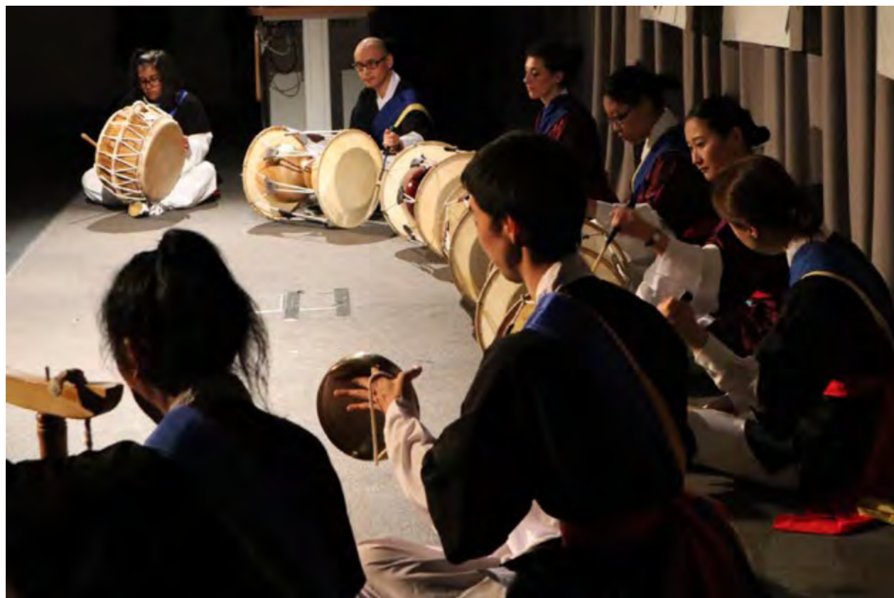
CONCERT SOAS Korean Music Societies Annual Concert 9 June 2018