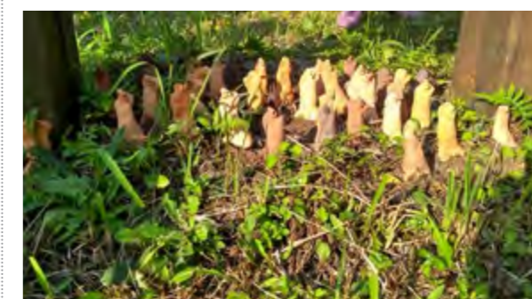
Clay figures at a Jeju massacre site on Korean province of Jeju Island