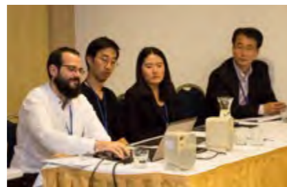
AKSE conference in Prague 2017