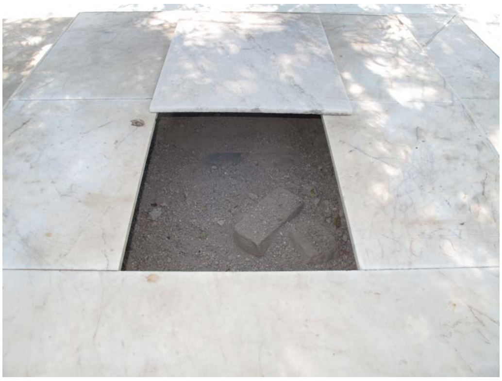
Fig. 6 Funeral relics under the cabūtarā of Muni Sampatlāl in Auraṅgābād

The pratimā of Muni Gaņeślāl in Auraṅgābād caused a great uproar in the Sthānakavāsī community, and could only be inaugurated after as series of court cases, briefly described by Vorā (1992: 191-3). Despite similar protests, in the last decade many portrait statues were put up by the aniconic traditions; for instance the painted statue of the Sthānakavāsī Upādhyāya Amarmuni (1903-1992) at Vīrāyatan in Rājagṛha and of the Terāpantha Ācārya Tulsī (1914-1997) in Bikaner (in a hospital) and in a commemorative shrine at New Delhi. The three portrait statues of Sthānakavāsī nuns Pravartinī Pārvatī (1854-1939), Pravartinī Rājamatī (1866-1953), Upapravartinī Svarṇa Kāṃtā (1929-2001) of the Pañjāb Lavjīṛṣi Sampradāya in Kupa Kalāṃ may be the first stone images of female mendicants in the aniconic traditions. Physical worship is prevented in most cases across sects by either wrapping the images with shawls ( cādar ), as in the case of the image of the "miracle working" Muni Kanhīrāma (1852-1872) (Nāthūrāma Jīvārāja Sampradāya) next to his stūpa at the heart of a necropolis of twenty-three samādhi s in Rohtak (Fig. 7), or the images of "Sant Śiromaṇi" Upapravartaka Phūlacandra or Phūlcand's (1913-2001)