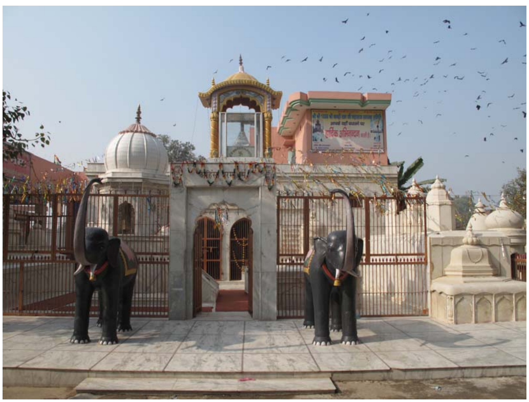
Fig. 7 Multi-shrined necropolis "Sant Kanhīrām Mahārāj Smārak" in Rohtak, with the wrapped statue of Muni Kanhīrām on top of the building behind his samādhi on the left

(Pañjāb Lavjī Ŗṣi Sampradāya) in Ratiyā (Fig. 8) and Śardūlgaṛh,<sup>51</sup> all represented the saints in sitting posture, or by encasing the image with glass covers or in other ways making access as unattractive as possible.