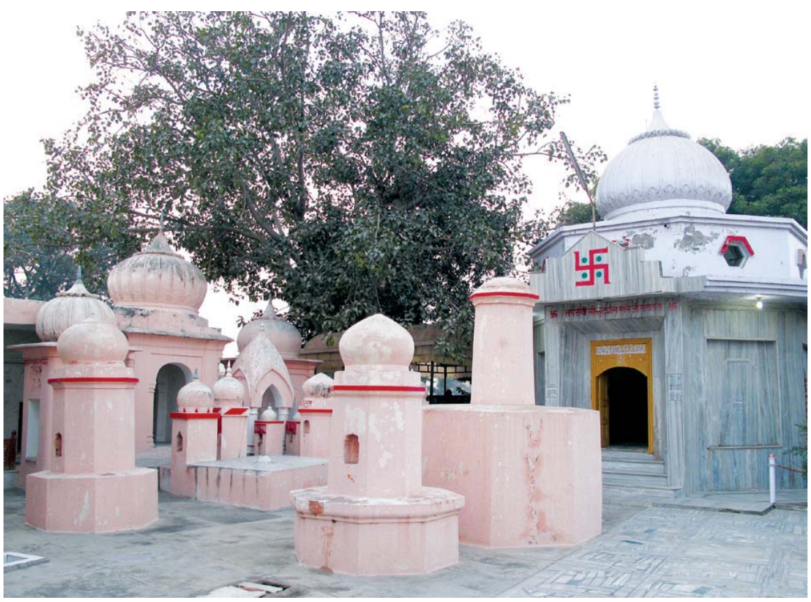
Fig. 1 Samādhi Sthal of "Tapasvī" Sudarśan Muni and other "Great Gurus" near the samādhi of Muni Lālcand in Ambālā

Sudarśana Muni (1905-1997) was constructed. (Fig. 1) These modern buildings are not solid structures but feature interior shrines with caraṇa-pādukās ; in the case of Lālcand a two-storey marble-clad construction with spaces for circumambulation of the footprintimage on the upper floor and of posters with detailed instructions on the preferred mode of worship and its "miraculous" benefits on the ground floor.