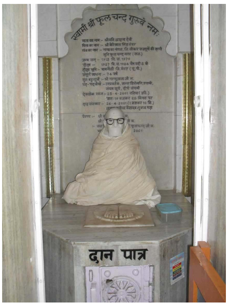
Fig. 8 Statue of Upapravartaka Phūlcand inside his samādhi in Ratiyā

image-worship"( sthānakavāsī paramparā kā virodh mūrti se nahīṃ hai balki mūrtipūjā se hai ) (ib., p. 367).<sup>52</sup>